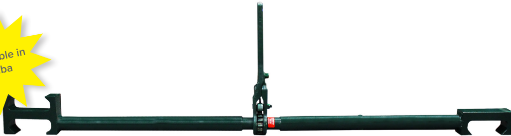
08-6050 TRACK GAUGE SPREADER, HEAD OF RAIL, NON-INSULATED