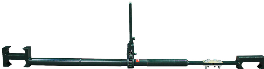
08-6055 TRACK GAUGE SPREADER, HEAD OF RAIL, INSULATED